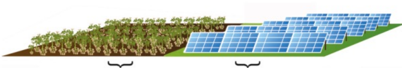
100% Crop or 100% Solar